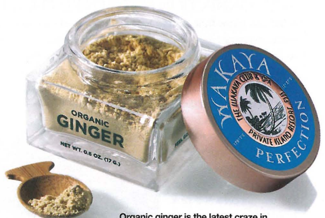
Organic ginger is the latest craze in nutritional beauty products.

"What we put inside our bodies is just as important as what we do on the outside, which is why we are adding ingestible supplements to our hair preservation regimen," said Bosley